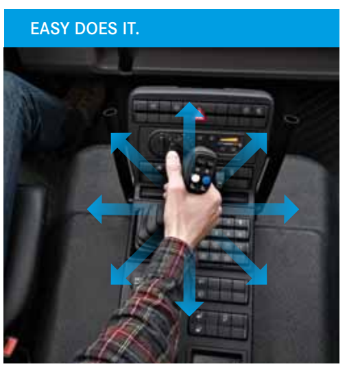
Sensitive yet powerful: the new multifunction joystick. For rapid, efficient working and complete control.

a huge field of vision, a minimal blind spot – the panoramic cab ensures a great view of the working implements and thus effectively helps prevent accidents. This brings about added safety particularly in situations where visibility is reduced.